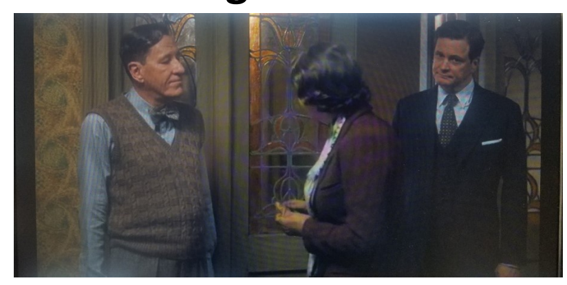
Stop at 1 hr 17 min 51 sec