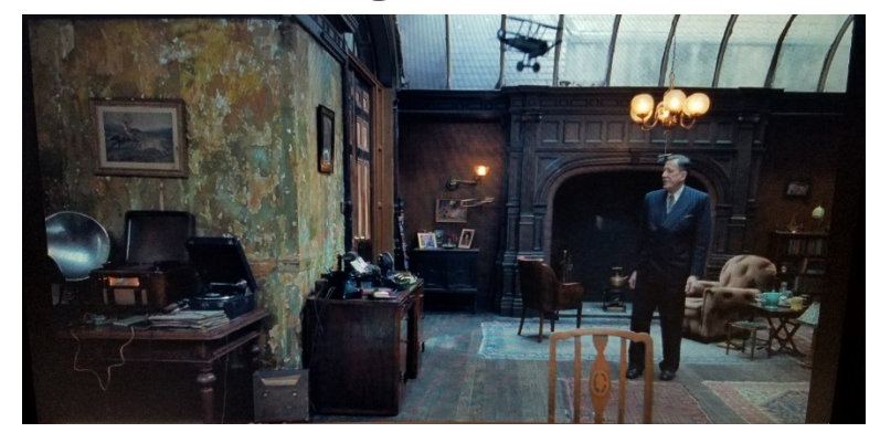
Stop at 27 min 52 sec