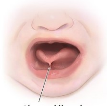
Abnormal lingual frenulum